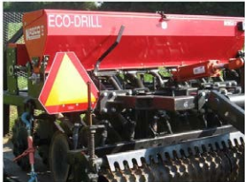
The KED-72 is 6' wide and capable of planting 9 rows, with 8" spacing. KASCO recommends a 25hp+ tractor, with sufficient lift capacity to handle approximately 1600 lbs. on back.

Hi-Tunnel Tool Loan Program, List of Tools & Loan Process Coös County