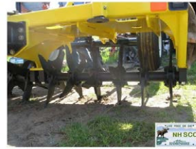
AWMP-075-AG-4 Salford AerWay. 45-75HP Tractor with hydraulics recommended. Cultivation width 7.5', Weight 2150 lbs.

No-Till Seeder & Rental Terms Grafton County