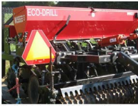
The K12D-72 is 6' wide and capable of planting 9' rows, with 8" spacing. KASCO recommends a 55hp+ tractor, with sufficient lift capacity to handle approximately 1000 lbs. on back.