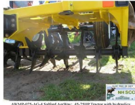
AWMP-075-AG-4 Salford AerWay: 45-75HP Tractor with hydraulics recommended. Cultivation width 7.5'. Weight 2150 lbs.