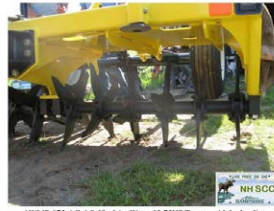
AWMP-075-AG-4 Salford AerWay, 45-75HP Tractor with hydraulics recommended. Cultivation width 7.5'. Weight 2150 lbs.

More Information no-Til Seeder & Rental Terms Grafton County