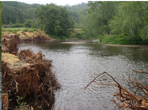
After (with Riparian buffers being planted this fall)