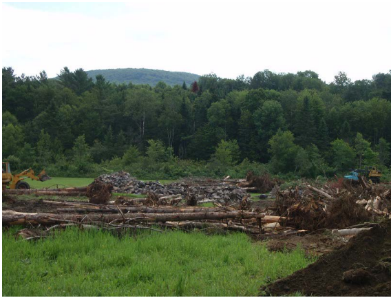
Materials in preparation for this project.

erosion. - improve or enhance the stream corridor for fish and wildlife habitat, aesthetics, recreation.