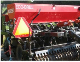
The KED-72 is 6' wide and capable of planting 9 rows, with 8" spacing. KASCO recommends a 35hp+ tractor, with sufficient lift capacity to handle approximately 1600 lbs. on back.

Loan Program - List of Tools & Loan Process Coös County