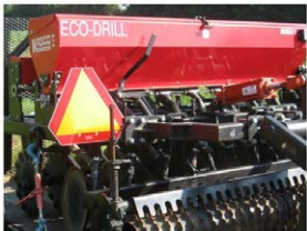
The KED-72 is 6' wide and capable of planting 9 rows, with 8" spacing. KASCO recommends a 25hp+ tractor, with sufficient lift capacity to handle approximately 1600 lbs. on back.

More Information Hi-Tunnel Tool Loan Program, List of Tools & Loan Process Coös County