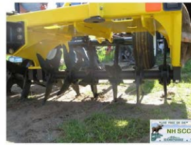
AWMP-075-AG-4 Salvaged AerWay. 45-75HP Tractor with hydraulics recommended. Cultivation width 7.5'. Weight 2150 lbs.

More Information No-Til Seeder & Rental Terms Grafton County