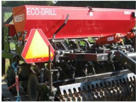
The KED-72 is 6' wide and capable of planting 9 rows, with 8" spacing. KASCO recommends a 25hp tractor, with sufficient lift capacity to handle approximately 1600 lbs. on back.

More Information No-Til Seeder & Rental Terms Grafton County