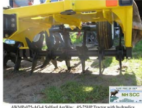
AWMF-075-AG-4 Salford AerWay, 45-75HP Tractor with hydraulics recommended. Cultivation width 7.5'. Weight 2150 lbs.

More Information No-Til Seeder & Rental Terms Grafton County