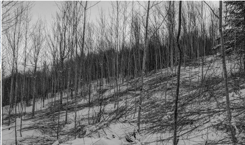
Before photo (left), After photo (above).