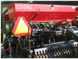
The KLD-72 is 6' wide and capable of planting 9 rows, with 8" spacing. KASCO recommends a 35hp tractor, with sufficient till capacity to handle approximately 1600 lbs. on back.

No-Till Seeder & Rental Terms Grafton County