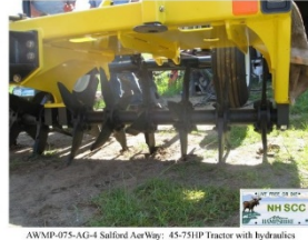
AWMP-075-AJ-4 Salford AerWay: 45-75HP Tractor with hydraulics recommended. Cultivation width 7.5', Weight 2150 lbs.

No-Till Seeder & Rental Terms Grafton County